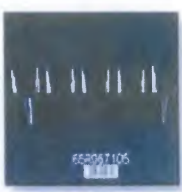
Evanded (II) Niciober and But Code