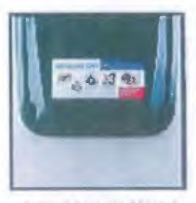
Muliti-Color in-Melai Label (LAGL)