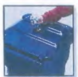
Optional Openings for Recyclables